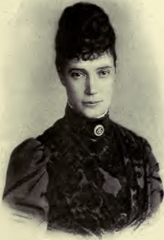
THE DOWAGER EMPRESS MARIE FEODOROWNA